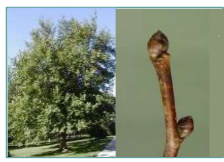
Red Mulberry brown, slender twig large buds with overlapping scales and milky sap