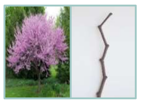
Eastern Redbud "zig-zagged" twigs