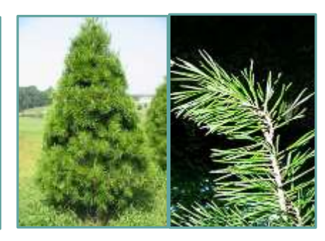
Virginia Pine needles are bluish-green and are in bundles of 2