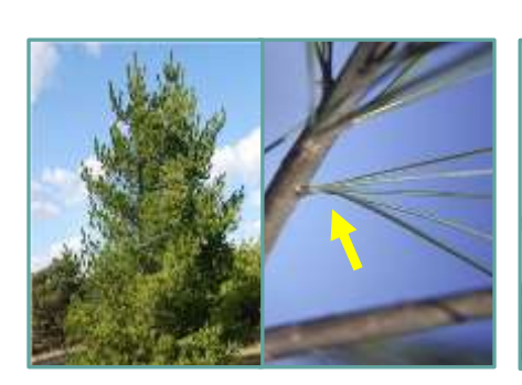
Eastern White Pine needles have bluish-green color and are in bundles of 5