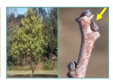
Common Persimmon dark 2 scaled (valvate) buds