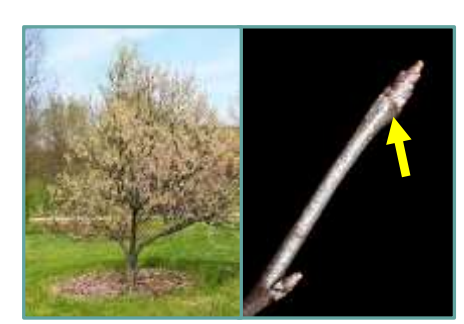
Wild Plum single bud at branch tip with overlapping bud scales.