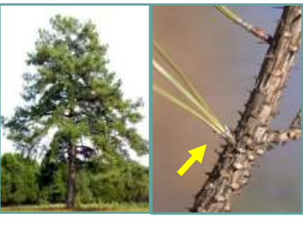
Loblolly Pine needles are green and are in bundles of 3