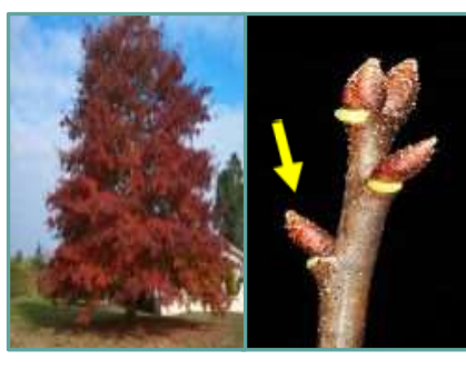
Northern Red Oak reddish brown colored pointed buds clustered at tip of branch